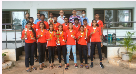
Inter-Collegiate Cross Country Race Team