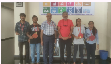
Participants of Table Tennis Tournament

4th August 2023 : Inter Collegiate Swimming Championship (Men) organised by Goa University.