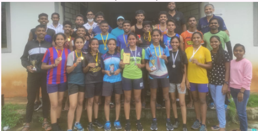
Cross Country Tournament Team